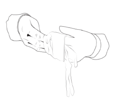
4) Insert the left, gloved hand into the cuff opening of the right glove.