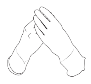
6) Pull the gloves up over the cuffs of the gown.