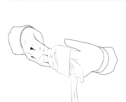
4) Insert the left, gloved hand into the cuff opening of the right glove.