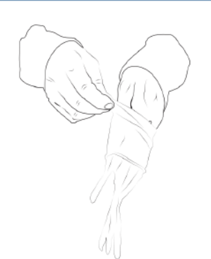
Holding the exposed inside cuff of the left glove with the right hand, put on the glove.