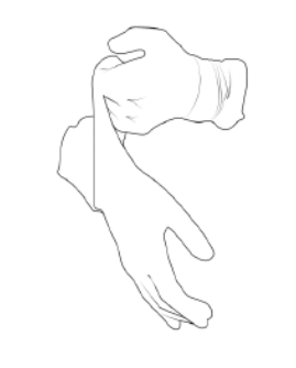
5) Pull the glove onto the right hand.