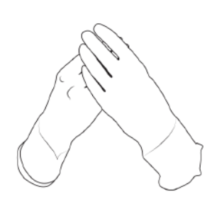
6) Pull the gloves up over the cuffs of the gown.