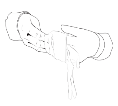
4) Insert the left, gloved hand into the cuff opening of the