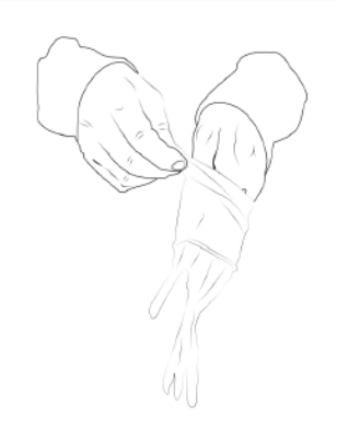
3) Holding the exposed inside cuff of the left glove with the right hand, put on the glove.